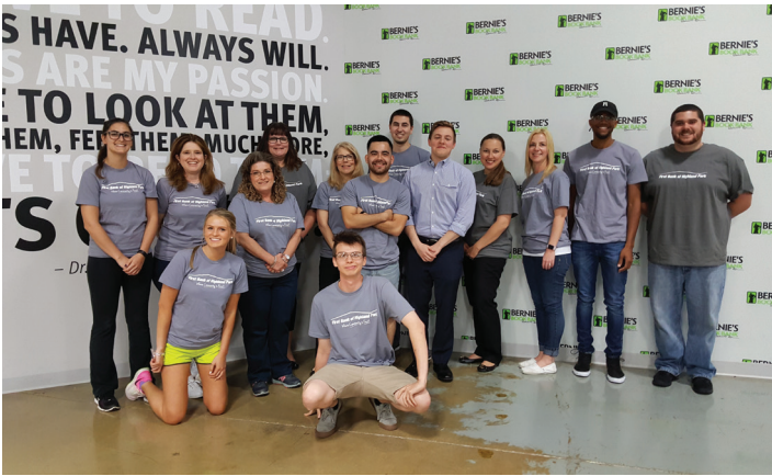
First Bank of Highland Park staff and summer interns volunteer at Bernie's Book Bank.